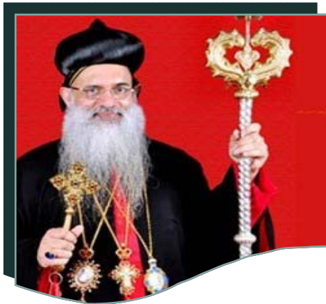
His Holiness Moran Mar Baselios Marthoma Paulose II, Catholicos and Malankara Metropolitan