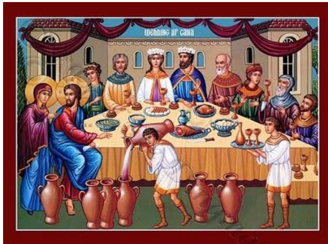
Above: An icon depicting the Wedding at Cana, the site of Christ's first miracle

We live in a world of sea change, and the human tendency is to experiment anything new that may appear as the norm. In recent times, much discussion and debate has taken place regarding abortion, contraception, same sex marriage, and much more. President Obama's favorable attitude towards same sex marriage has stirred a hornets' nest in the United States. In a newly emerging moral context, our faith is challenged and many are confused as how to conduct their lives.....cont'd - pg 3