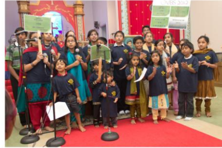
OVBS held at St. Gregorios Orthodox Church, Austin TX from August 17th through 19th