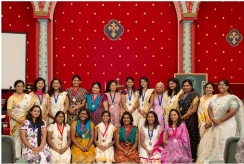
The winners of the Southern Regional Martha Mariam Vanitha Samajam talent competition held at St. Gregorios Orthodox Church, Austin on August 25th, 2012 along with General Secretary and Regional Secretary.